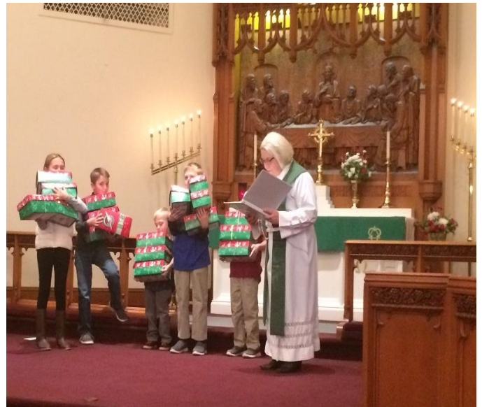
Blessing of the Shoeboxes for Operation Christmas Child

Total of all funds in Emmanuel Lutheran Church: $ 51,483.51