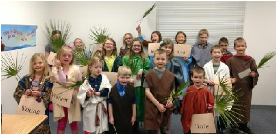
Sunday School kids are getting ready to sing on Palm Sunday