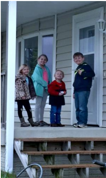
Delivering May Baskets