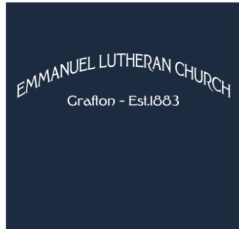
Navy Blue Shirt with White Print