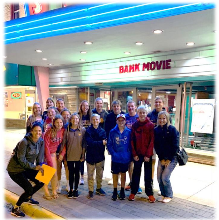
Logos Legos Outing to the movie "Overcomer" in Osage on September 26 th

There will be a box for your convenience. Any checks should be made out to "Grafton Cemetery" not Emmanuel Lutheran.