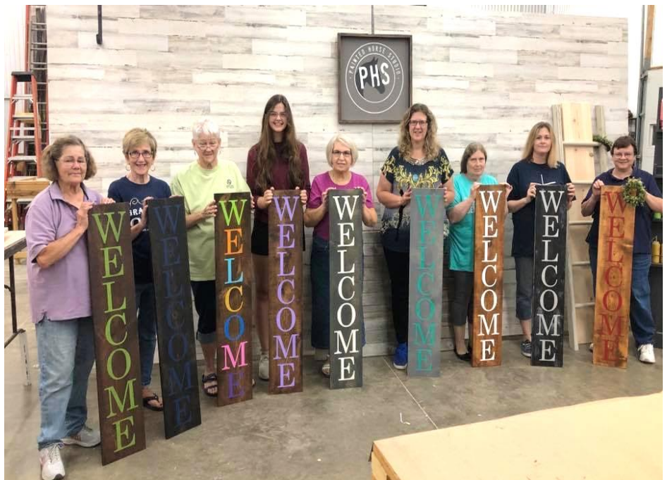
Ladies Painting Event