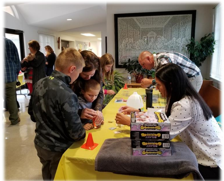
Rally Day Sunday, September 8 th