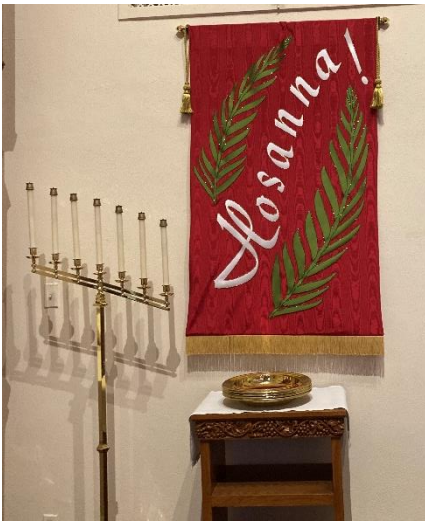
Banners and decor for the season